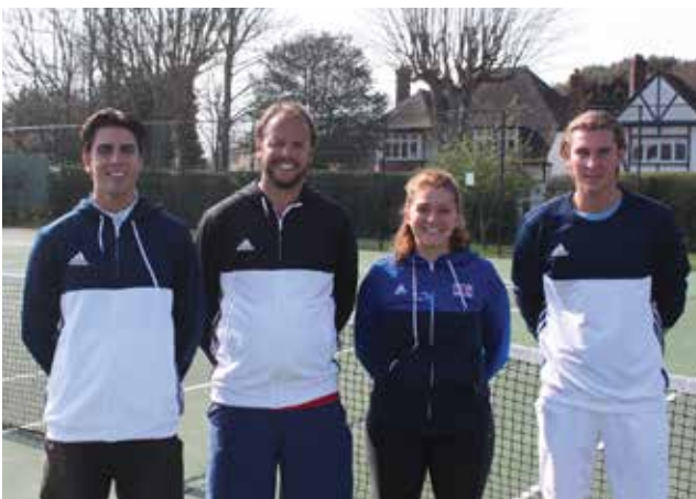
GIDEA PARK LTC COACHING TEAM